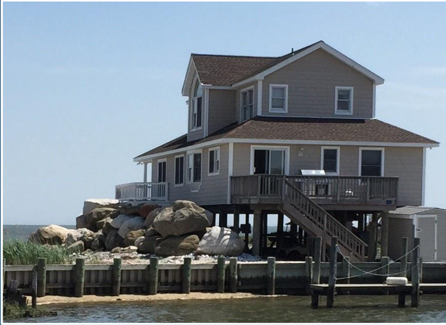
Tuckerton Beach – Post Sandy